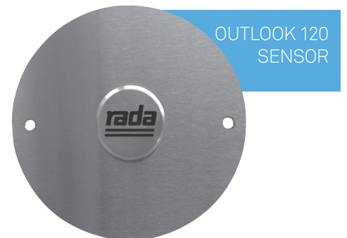
OUTLOOK 120 SENSOR

RADA OUTLOOK RADA DIGITAL NETWORKING RADA COMMISSIONING SERVICE