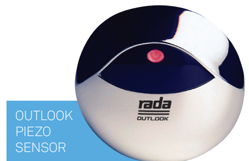
OUTLOOK PIEZO SENSOR