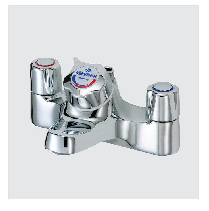
Specify as: Meynell Bonus (PEBS0026.1P)

Bath/thermostatic shower mixer with conventional washer bath tap headworks.