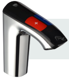
Thermostatic basin tap RADA MX1 20CUK (72940-CP)

Intelligent Care basin and panel mount taps with non-touch temperature and flow controls.