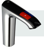
Thermostatic high basin tap RADA MX1 40CUK (74010-CP)