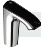
Thermostatic basin tap RADA MX1 20NCUK (72941-CP)

Intelligent Care basin and panel mount taps with non-touch flow controls.