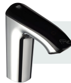
Intelligent thermostatic basin tap RADA MX1 20NF (72943-CP)

Find out how Intelligent Care can help you deliver better facilities for your patients and staff.