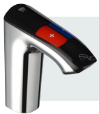
Intelligent thermostatic basin tap (TC included) RADA MX1 20F (72942-CP)

A variant of the Intelligent Care basin tap for use in places like visitor washrooms, with a choice between the two available control options.