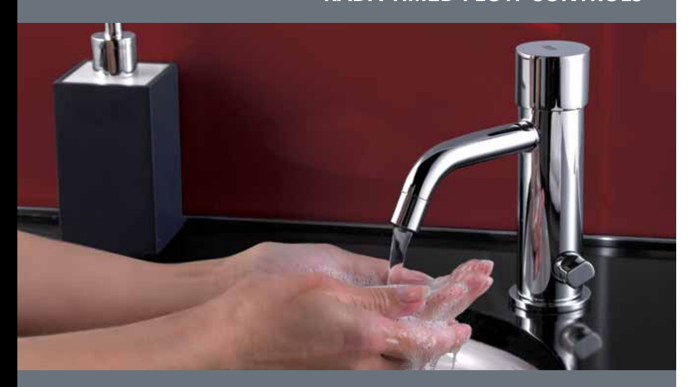
PERFECTION AND PRECISION FOR SHOWERING AND WASHROOMS